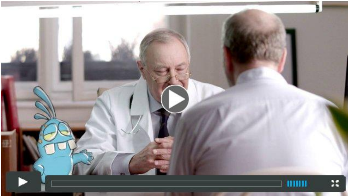
mySugr Academy - Tame your Diabetes Monster